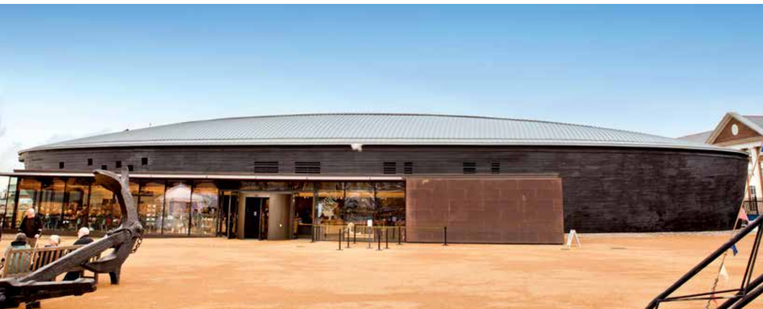
Mary Rose Museum, UK