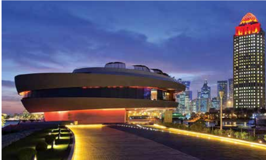
Nobu Restaurant, Qatar

With a wide technical know-how and company-owned manufacturing facilities in Greece, Serbia and China, KLEEMANN caters to the needs of the global market through constant use of state-of-the art mechanical equipment built according to its high safety standards.